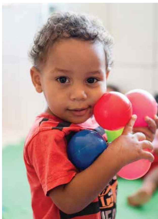
Community Center Project Execution in 2018

It is a program for the prevention of child abuse and sexual violence and for the promotion of good family relations. Through sequential workshops, Claves provides a playful and participatory approach, which promotes the reduction of vulnerabilities of children and adolescents through the development of personal, family and community strengthening factors. Songs, dances, board games, theatrical games, stories, puppets, riddles, puzzles, and other techniques are explored in workshops and allow children and adolescents to empower themselves to deal with difficult situations.